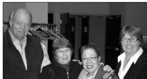
Some Side Game winners: